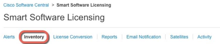
Figure 2: Inventory