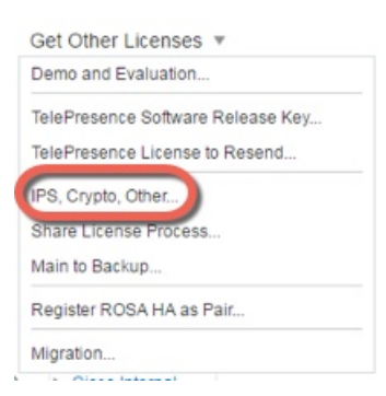
Figure 2: IPS, Crypto, Other