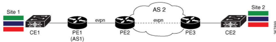
Figure 4: BGP over MPLS (Inter AS)