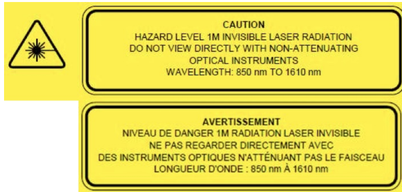
Figure 1: Class 1M Laser Product Label

Take note of the following optical connection warnings: