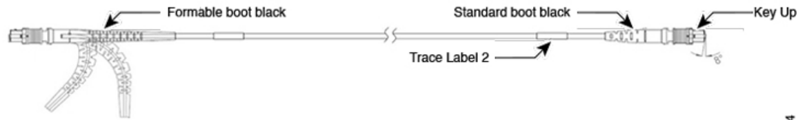
Figure 2: Cable with Formable Boot and Standard Boot