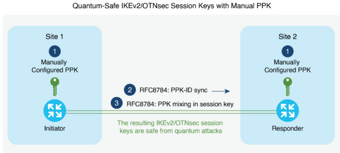
Figure 3: Quantum-Safe IKEv2 and OTNsec Session Keys with Manual PPK