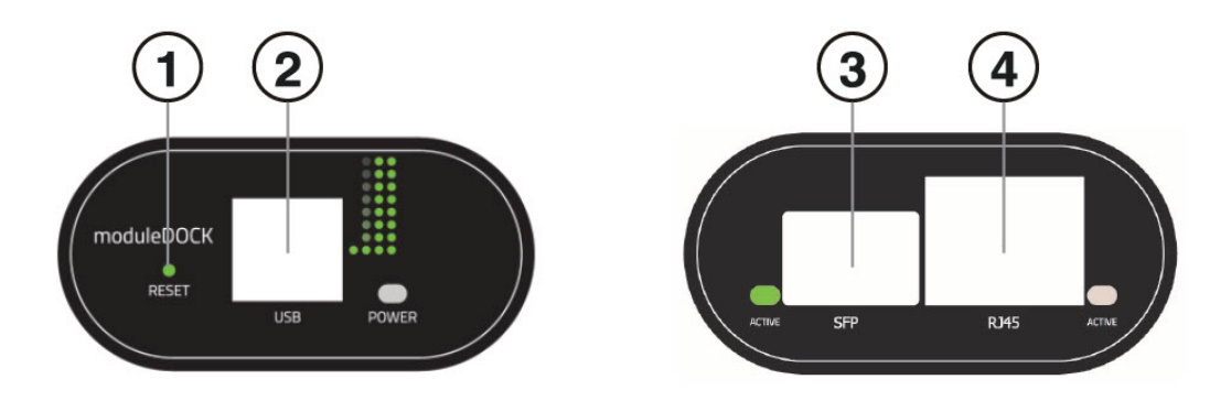
Figure 2: Module Dock Components

The following figure shows the features of the Module Dock. See Module Dock LEDs, on page 3 for a description of the LEDs.