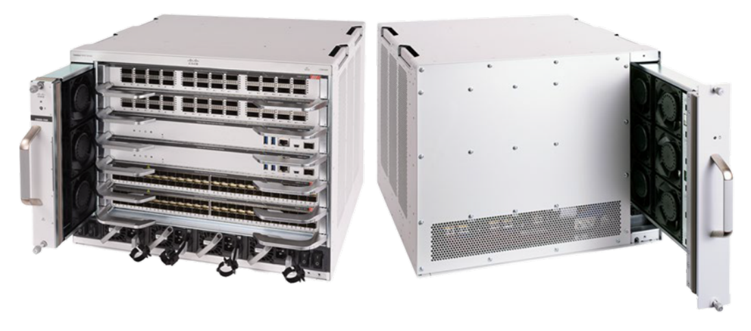
Figure 2 . Cisco Catalyst 9606R Chassis with Fan Tray

Each Cisco Catalyst 9600 Series switch uses a single serviceable fan tray for cooling. The switches can optionally be accessed from the rear for flexible cable management. The chassis is optimized for enterprise closets, with side-to-side airflow. All fan trays are composed of multiple independently controlled fans. If any single fan fails, the system will continue to operate without a significant degradation in cooling. Fan speeds change dynamically to compensate for fan failure. Cisco Catalyst 9600 Series fans have a barometric sensor, which allows slower fan speed curves at lower altitudes. The fans also have individual Pulse-Wide Modulation (PWM) fine-tuning to reduce variability in fan revolutions per minute (rpm) under throttled conditions. The measured acoustic noise in a formal NEBS test environment is 77.7 LWAd (dB). The chassis are designed to accommodate fanless operation of up to 90 seconds to enable serviceability.