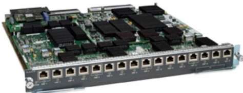
Figure 2. 6800 Series 16-Port 10 Gigabit Ethernet Copper Module

The 6800 Series 16-port 10 Gigabit Ethernet Copper module (Figure 1) provides up to 176 10 Gigabit Ethernet Copper ports in a single Cisco Catalyst 6513-E Switch chassis, 352 10 Gigabit Ethernet Copper ports in a Cisco Catalyst 6500 Virtual Switching System (VSS) 2T and is primarily designed for data center access with a secondary use case for switch-to-switch connectivity.