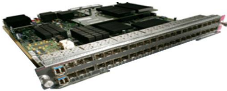
Figure 5. 6800 Series 48-Port 10/100/1000 Interface Copper Module WS-X6848-TX-2T/2TXL