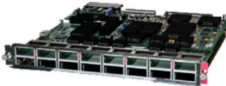
Figure 1. 6800 Series 16-Port 10 Gigabit Ethernet Fiber Module