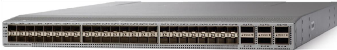
Figure 3. Cisco Nexus 93180YC-FX Switch

Table 2 lists the Cisco Nexus 9300-FX platform switch specifications.