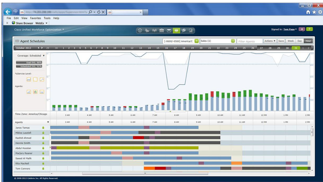
Figure 3. Workforce Management Agent Schedule View