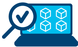
Third-party software components