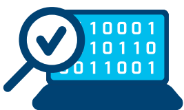
Cisco proprietary code

PSIRT notifies customers and the public simultaneously