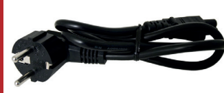
EU Version AC Cable with Earth Ground