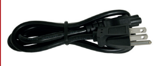
USA Version AC Cable with Earth Ground