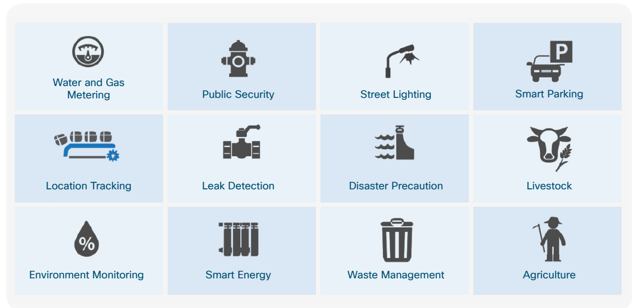
Figure 1. Customer use cases

The Cisco solution can be used to support the customer use cases shown in Figure 1.