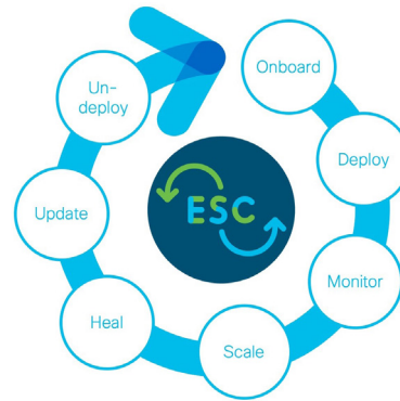
Figure 1 - Lifecycle management

the entire lifecycle: from onboarding and deployment to monitoring health, scaling in response to demand, remediating issues, and finally tearing down services and freeing resources for other applications and services.